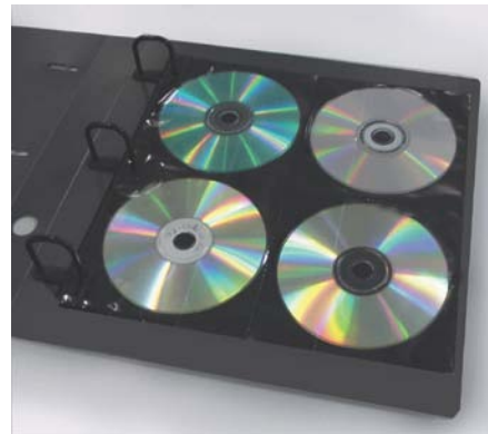
8 to a Page - CD/DVD Storage