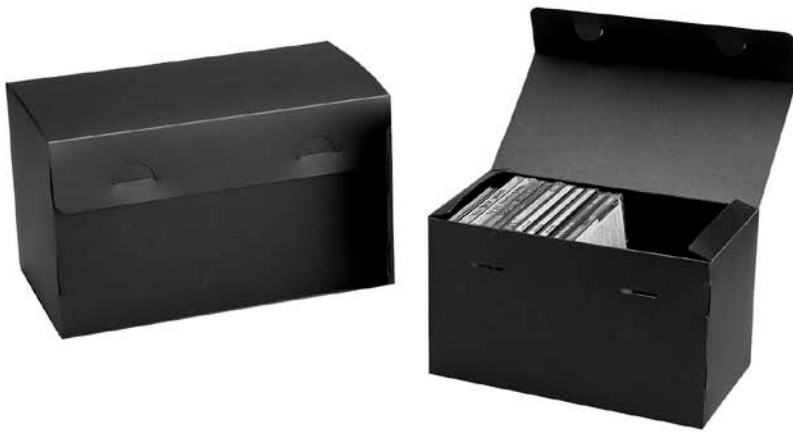
The CD BOX – closed and opened