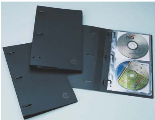
2 to a Page - CD Files

CD/DVD Storage – 8 CD's to a page Code: CDPKT8-10 (Packs of 10 pages) for use in conjunction with 25BSC and 40BSC Binders and Slip Covers